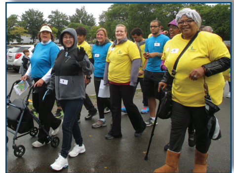
The Fall River/Bristol County Support Group members (in blue shirts) join other walkers along the route.