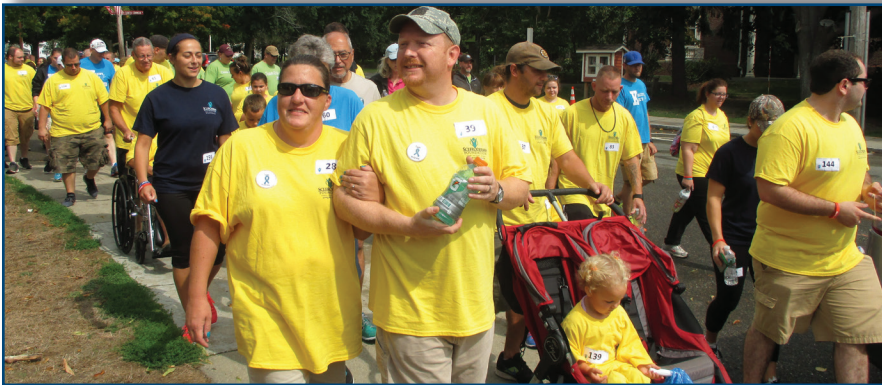
North Shore Walkers head down Main Street in Topsfield, MA